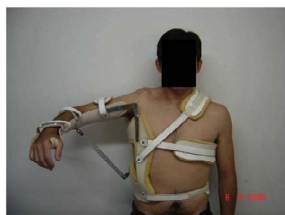
Figure 2. Position of the brace at 90° of abduction in the postoperative period.