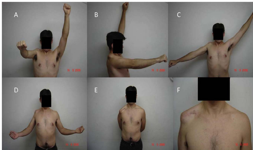
Figure 3. Active mobility results in the postoperative period. (A/B) Flexion; (C) Abduction; (D) External rotation; (E) Internal rotation; (F) Cosmetic appearance.

The development of microsurgery has contributed to advances in surgery of the brachial plexus. Neurotization and nerve grafting are proposed to restore the physiology of the injured region, without causing any anatomical changes. Recent studies have clarified their indications and applications [1].