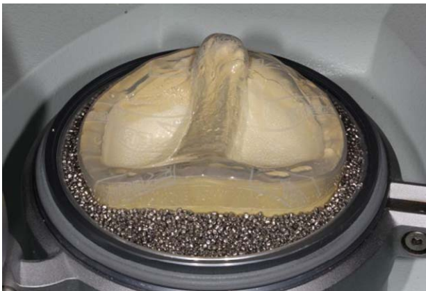
Figure 2. Fabrication of first layer. A working model was prepared by blocking excessive undercuts with plaster. The underlying 3 mm thick ethylene vinyl acetate (EVA) sheet (Erkoflex®) was formed using a positive pressure method.