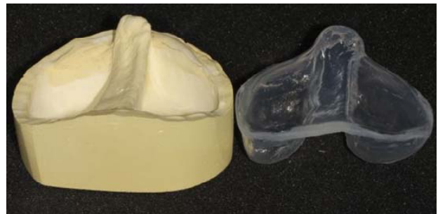
Figure 4. Custom-made temporary obturator. The hollow bulb and center parts are flexible and easy to insert into the mouth.