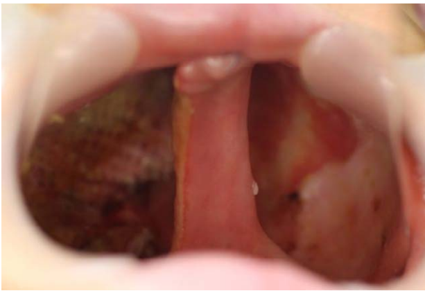
Figure 1. Intraoral findings. After maxillectomies on both sides (1992 left side and 2011 right side), only a narrow medial section of the soft and hard palate remained.

Maxillary cancer is generally treated surgery with or without radiotherapy. There were some reports of bilateral maxillary cancer, Shibuya et al. reported a remarkably high incidence of contralateral maxillary cancer (67 times higher) and suggested a link with radiotherapy [4]. In patients who have undergone bilateral maxillectomy, and whose anatomical features make it difficult for them to retain a conventional prosthesis, this type of temporary