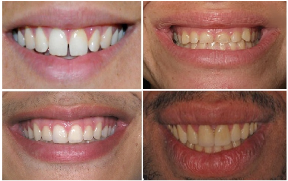
Image 1. Sample of smiling photographs for the participants in the study.

tistry using the same scale ( Image 1 ).