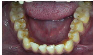
Figure 5. Intraoral occlusal view—lower jaw.