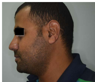
Figure 17. Lateral—extraoral view after two weeks.

of subcutaneous emphysema produced during surgical procedures between 1993 and 2008. They noticed that dental extraction was involved in 7 cases (6 for using an air-driven handpiece and the other of unspecified origin).