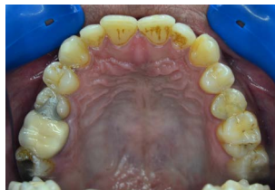
Figure 4. Intraoral occlusal view—upper jaw.