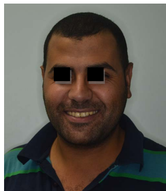
Figure 16. Lateral—extraoral view after two weeks.