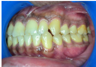
Figure 2. Left side—intraoral view.