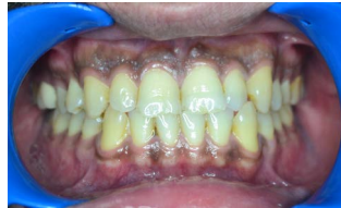
Figure 1. Frontal—intraoral view.

A 30-year-old male patient was referred by his dentist to the dental department of Al Zafer hospital with a chief complaint of Localized oral pain related to the lower left side of the oral cavity. He was in a full permanent dentition stage ( Figures 1-5 ).