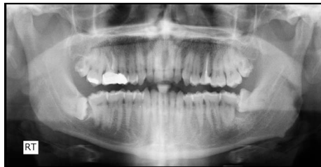
Figure 6. Panoramic radiograph.

During the sectioning procedure, the patient reported a swelling of his face with mild upper neck pain on the same side. An immediate swelling was observed of the upper and lower cheek and lower left eyelid, accompanied by audible and palpable crepitus ( Figures 7-10 ).