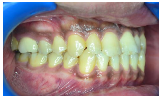
Figure 3. Right side—intraoral view.