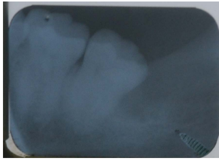
Figure 11. Postoperative periapical radiograph.