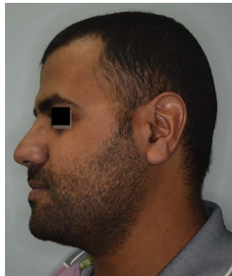
Figure 15. Lateral—extraoral view after one week.