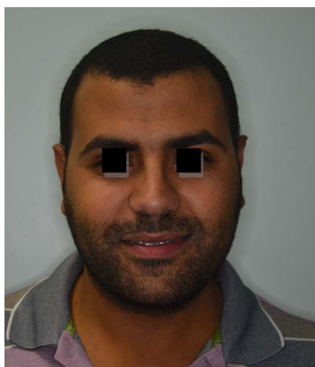
Figure 14. Frontal—extraoral view after one week.