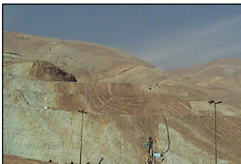
Figure 3. A view of the Emam Zadeh Davood fault zone in northwest of Tehran (view to the northeast).