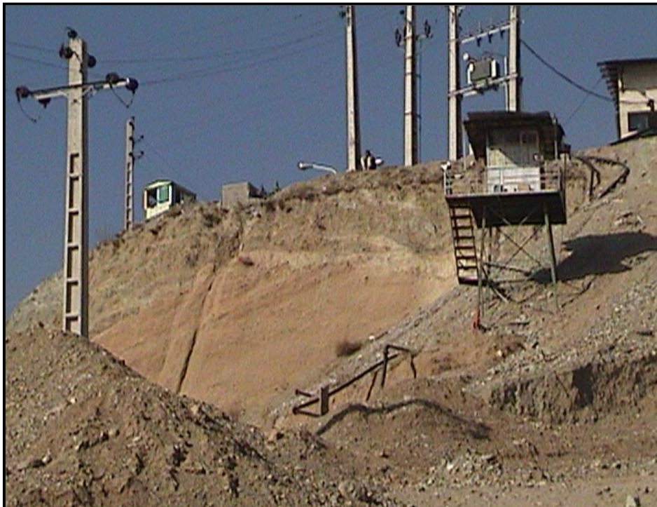
Figure 5. A view of the North Tehran fault zone in north (Hesarak) Tehran (view to the north).

Although, many earthquakes occurred at the intersection of the Garmsar fault zone with the southeast continuation of Parchin fault zone and the intersection of the Mosha fault zone with the northeast continuation of North Tehran fault zone ( Figure 5 ).