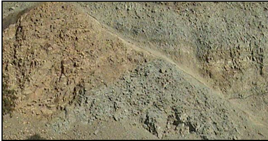
Figure 4. A view of the Pourkan-Vardij fault zone in northeast of Karaj (view to the northwest).