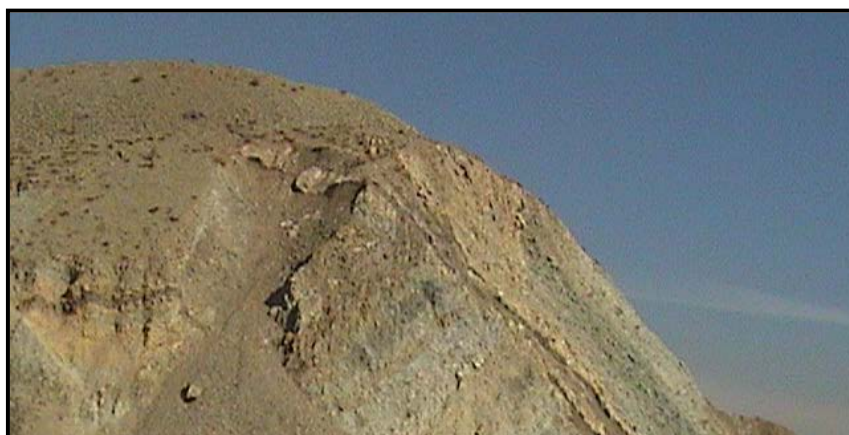
Figure 2. A view of the Mosha fault zone in northwest of Tehran (view to the east).

This fault set comprises three fault zones striking 306^{\circ} - 324^{\circ} with high dip angles. Among them, the Mosha (Figure 2), Parchin and Pishva fault zone are the major Quaternary fault zones. The Emam Zadeh Davood (Figure 3), Pourkan-Vardij (Figure 4) and Kuh-e-Sorkh are a minor Quaternary fault zones.