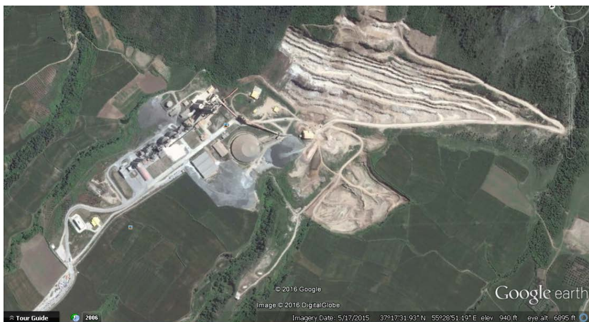
Figure 2. The aerial map from study area and sampling stations.

After recording the test results and parameters in the check list entered the computer and using SPSS and Excel software were analyzed. To analyze the data, were used of descriptive and inferential statistics. Descriptive statistics include tables and diagrams comparing the average amount of silver, arsenic, cadmium, cobalt, chromium, cesium, bismuth and barium in, oak, Siah Tello plants and straw according to ppm. In inferential statistics to determine the normal distribution of the metals silver, arsenic, cadmium, cobalt, chromium, cesium, bismuth and