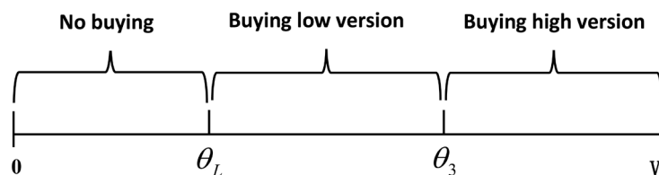
Figure 3. The consumer r's decision when first selling low version, then selling high version.

Defining \theta_3 = \frac{p_{H3} - p_{L0}}{1 - \lambda_3} - \frac{\mu(q_{H3} - \lambda_3 q_{L3})}{1 - \lambda_3} + \frac{\Delta u}{1 - \lambda_3} , \Delta u > 0 indicates the waiting cost of preferring a high version. When \theta \in [0, \theta_L) , consumers do not buy any products. When \theta \in [\theta_L, \theta_3] , consumers buy low version. Due to information asymmetry, the consumers do not know that the provider will delay the sale of the high version product. When \theta \in [\theta_{HL}, \theta_3] , if their waiting cost is greater than the waiting cost, they will choose to purchase the low version, otherwise they will wait for the high version. When \theta \in [\theta_3, V] , consumers buy high version (Figure 3).