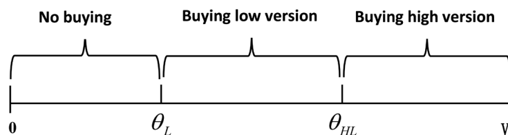
Figure 1. The consumer r's decision when simultaneous selling the high and low versions.

Proposition 1: When the provider chooses to sell both high and low versions, only when the network externality is met 0 < \mu < \frac{1}{2} , the demand for lower version products is greater than zero.