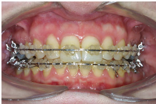
Figure 1. Ceramic brackets bonded to ceramic restorations in-vivo.

Two surface conditioning methods of the ceramic blocks