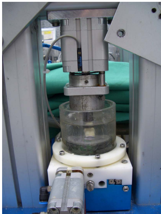
Figure 2. Simulation of the moisture and temperature changes in the oral environment in a mastication device with warm (55°C) and cold (5°C) distilled water (6000 cycles).

Additionally, the Adhesive Remnant Index (ARI) was determined. The classification of the ARI-index was as follows: “0” means that there is no composite left on the enamel. The score of “1” shows, that it remains less than 50% of the composite on the enamel. The score of “2” indicates that more than 50% of the composite remained on the enamel. And the score of “3” means that all composite remained on the enamel.