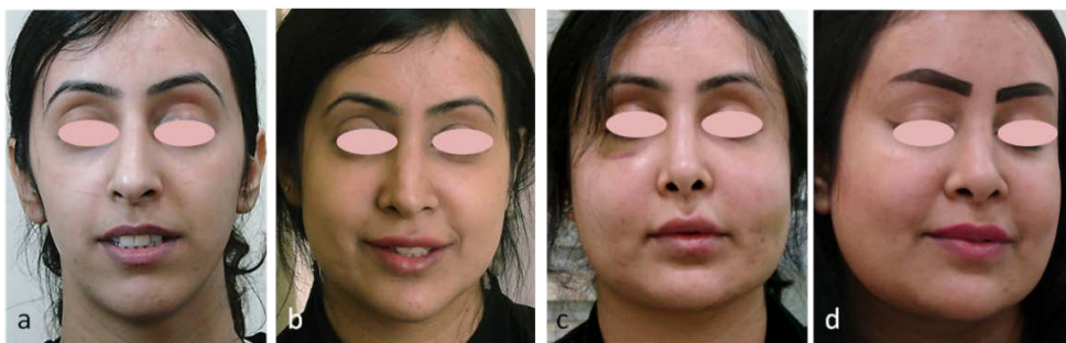
Figure 1. (a) Mild bilateral asymmetric facial microsomia; (b) Three years after fat transfer to the mandibular angle regions associated with anterior maxillary osteotomy and shortly afterward followed with rhino- and genioplasty; (c) One year later when bodyweight started to increase, just prior to fat re-grafting from the mandibular to the temporal areas and (d) Retained temporal area contour 30 months after the fat re-distribution (The showing recurrent mandibular angle bulge was due to further body weight gain).

Changes in adipose tissue volume are principally related to cell size and its intra-cellular lipid content. While the number of fat cells was generally assumed to be stable after full physical adolescent growth has been achieved [1], hyperplastic obesity has been proven manifestly as body fat levels exceed 40 kg [2]. On weight loss, fat cells shrink and may even dedifferentiate and on weight gain they redifferentiate and increase in volume [3]. Although transferred cells are not expected to regenerate, new adipose cells are thought to be developed by a population of stem cells, residing in the stromal vascular fraction of lipoaspirate tissue [4]-[6]. On weight gain,