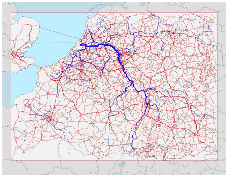
Figure 3. Calibrated assignment for the Benelux + region.