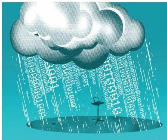
Figure 2. Cloud computing scenario [8].

It means accessing computing product and services via the cloud powered by external parties through a remote server [8]. In another perspective cloud computing referred to applications deployed as a service via the internal network with a physical data centre responsible for implementing and managing these services [9]. While [10] [11] defined cloud computing as a subsidiary of grid computing and the model is based on pay-per-use. It provides efficient use of energy, affordable price technologies that help when accessing, sharing of services together with storage and management of resources. Of course, the idea has numerous advantages which among them are; network access, infrastructure sharing, reduction of cost of operations, maintainability, reliability, flexibility together with different service, and so on. Figure 2 depicts the concept of cloud computing model or services.