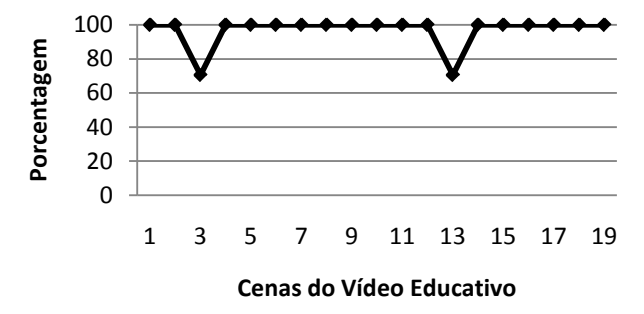
Figure 1. Clarity of the scenes of the video "Children Diarrhea: you are able to prevent it". Fortaleza, Ceará/Brazil, 2013.

Regarding the field of self-efficacy, 88.2% (15) of women believed they could follow the guidelines indicated in the video in its daily, 100% (17) stated that the scenes have allowed mothers to think about their health and his child and 94.1% (16) felt confident to prevent diarrhea in her child. Persuasion in the field, 94.1% (16) said they would be able to advise other mothers in relation to preventive care and management of childhood diarrhea (Table 2).