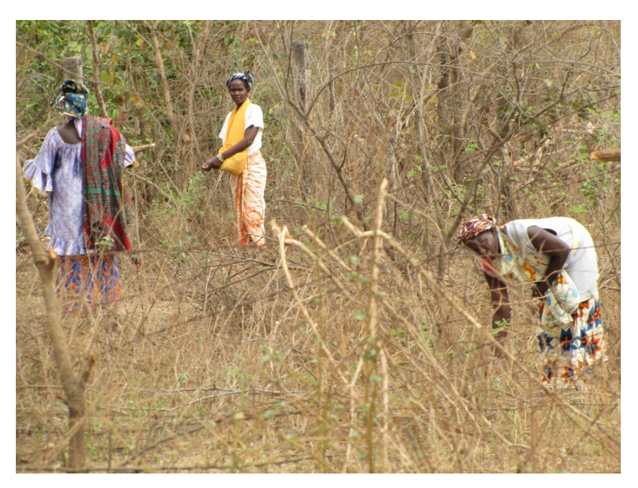
Figure 1. Collection of L. Hastata's leaves in the bush during dry season at Kédougou.

Three batches of Leptadenia hastata and two of Sesbania obtusifolia leaves were