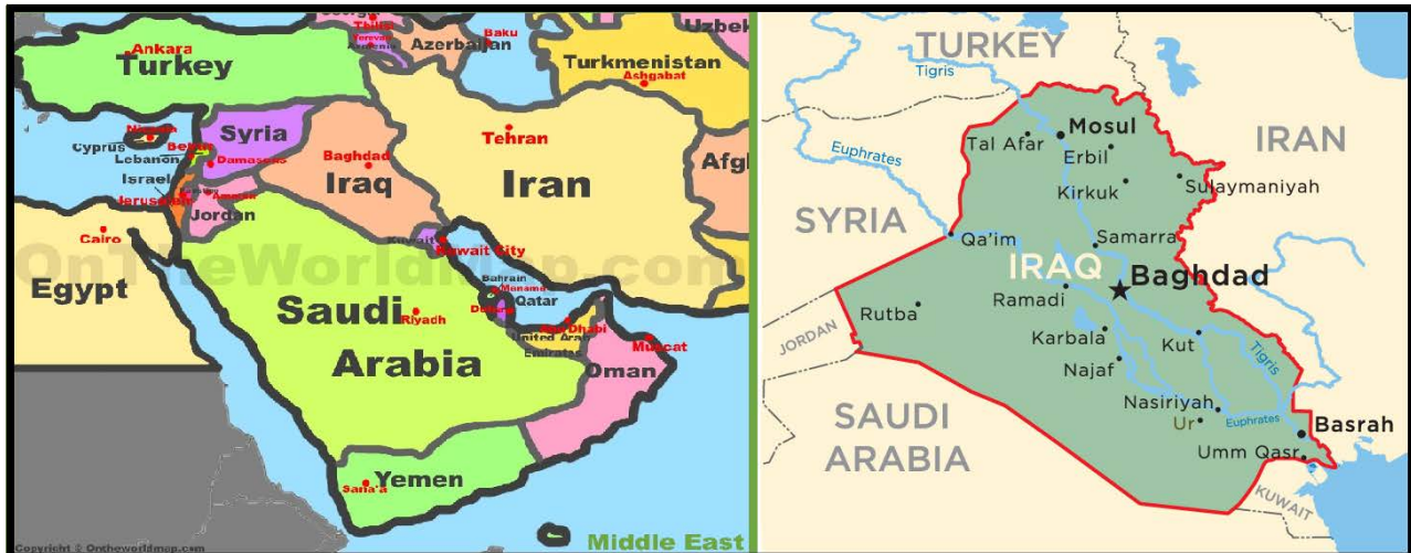
Figure 1. Location of Iraq within the Middle East.

Euphrates are the main two rivers of Iraq. The waters of these rivers come from Turkey (71%), Iran (6.9%) and Syria (4%) while the remainder is from Iraq. This implies that 100% of the Euphrates and 67% of the Tigris, waters come from outside Iraq respectively [9] [10]. Groundwater Resources reach 1.2 Billion cubic meters (BCM) and form only 2% of the consumed water. The flow of the rivers fluctuates from 10 to 40 BCM depending on the hydrological conditions with an average of 30 BCM [10].