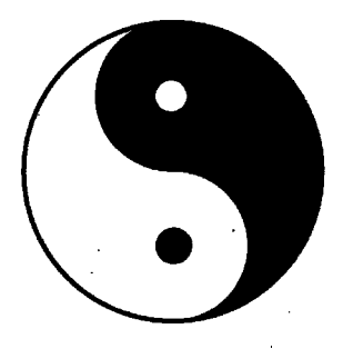
Figure 1. Tai Chi diagram.