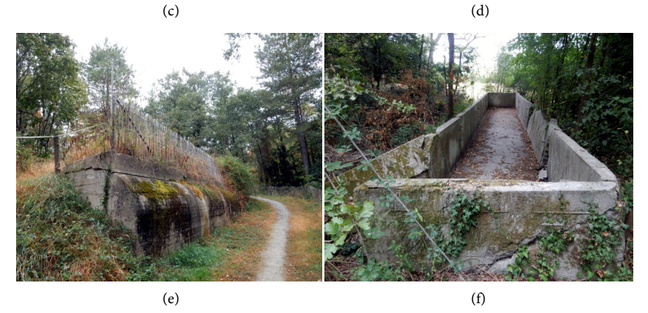
Figure 6. BDU site surviving components—(a) bunker (47); (b) bunker (50); (c) bunker (56); (d) bunker (31); (e) bunker (40); (f) concrete cistern.

its heating and aeration system disappeared. Only aeration conduit portions were in place on the walls. Their external concrete structures were in good preservation state. The coverage of bunker (31) was further covered by a recent metal sheet. Bunker (50) was accessible during the first visit. Its interior was in good preservation state with armoured doors still in place. All the original furniture disappeared and only aeration conduit portions were in place on the walls. Its external concrete structure was in good preservation state and the coverage was further covered by a recent metal sheet.