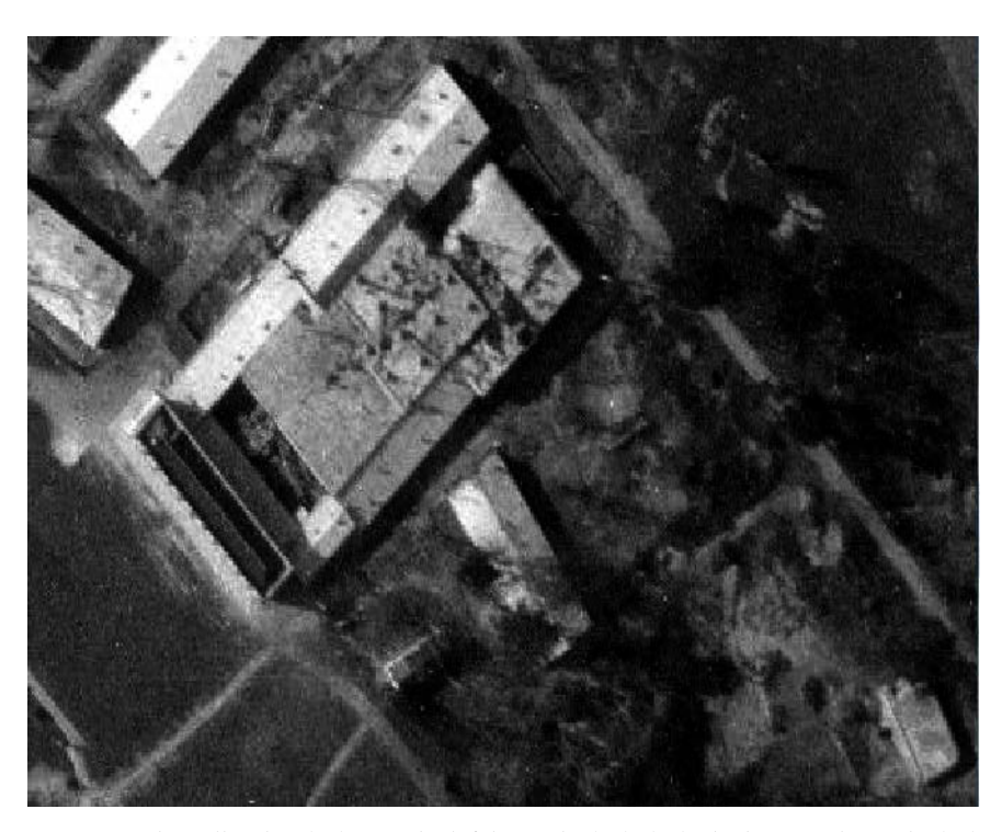
Figure 8. Admiral bunker (37)—on the left barracks (30), (33), the hanging barracks (34), (36), on the right barracks (38) (39) and bunker (40).

A recent shower system was in place at the entrance, complete with its white rectangular base, hot and cold water mixing taps, but no splash guard. Recent toilets were in good preservation state. All the original armored doors were in