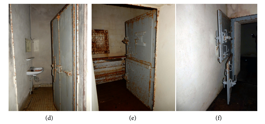
Figure 9. Admiral bunker (37)—(a) tunnel towards the castle; (b) bunker entrance, original light armored door 19P7; (c) shower system; (d) toilet in good preservation state; (e) original heavy armored door 434PO1 of a close combat defence room (2), on the wall defence original plate 483P2; (f) original armored port 434PO1.