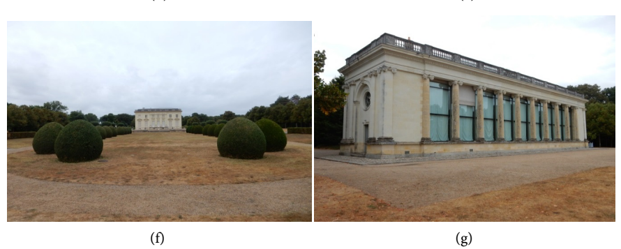
Figure 4. BDU site surviving components—(a) pavilion tours and grids at the Domaine entrance; (b) access lane; (c) entrance gate; (d) castle gate; (e) castle (25) front facade; (f) castle (25) rear facade, (g) orangery (35).

in the terrain; so that its type and internal and external preservation states have not been ascertained. The bunker (17) was accessible and used by the Domaine garden service. Its entrance side was covered by vegetation and a recent wood