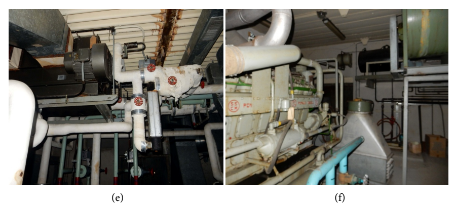
Figure 11. Admiral bunker (37): (a) plan: 2 close combat defence room, 27 computing room, 32 commander (Admiral room), 57 operation room, 79 emergency current, 85 foreman, A access stair, O orangery, T tunnel to the castle (Coiffard, 2006)-numbering according to Rudi, 1998; (b) black painted, electrical pumps with white distributors; (c) black pump on the left, armored door 722P3 in middle, galvanized conduit on the right; (d) grey painted pumps; (e) white insulated conduits with red painted taps; (f) diesel motor.

also provided with a crank for manual operation. The emergency electrical generator was in good preservation state (Figure 11(a)). It comprised a diesel motor connected to an alternator. The diesel motor hosted an oval label having the red letters SSCM inside and the red letters PDY outside. It received diesel fuel through a blue conduit, external air through a blue plastic conduit about 40 cm in diam. and evacuated exhausted gas through an insulated white conduit. The white painted alternator Leroy TA 450 leaked oil from its axis, and a stain formed on