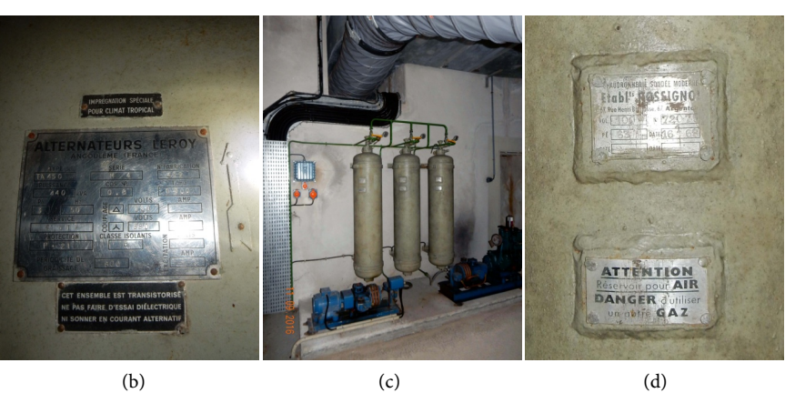
Figure 12. Admiral bunker (37): (a) alternator Leroy TA 450, on the right grey painted control cabinets, on the ceiling, joints for the generator lifting; (b) alternator data plates; (c) cylindrical bottles and two air compressors on the floor; (d) two metallic labels on one bottle.

the white painted floor. On the room ceiling, white metal joints for the generator lifting were in place. The alternator grey and blue painted control cabinets were in good preservation state. A white arrow near two metallic black data plates and a silver data plate on the alternator indicated the rotation direction. The data plates ( Figure 11(b )) informed: