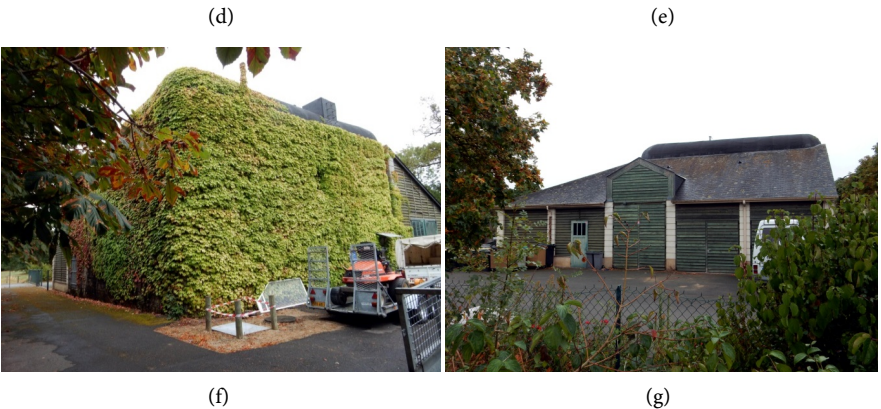
Figure 5. BDU site surviving components—(a) barrack (8) front side; (b) barrack (8) rear side-on the far left barrack (7); (c) castle dependence (16); (d) pool (24); (e) mound covering bunker (10); (f) bunker (17) entrance side; (g) barrack hanging on bunker (17).

barrack, used as garage and store of garden materials, was leaning on the opposite bunker side. The interior was in good preservation state with original armoured doors still in place. Bunkers (31), (47), (56) closed during the first were accessible during the second visit. Their interiors were in good preservation state with armoured doors still in place. All the original furniture and components of