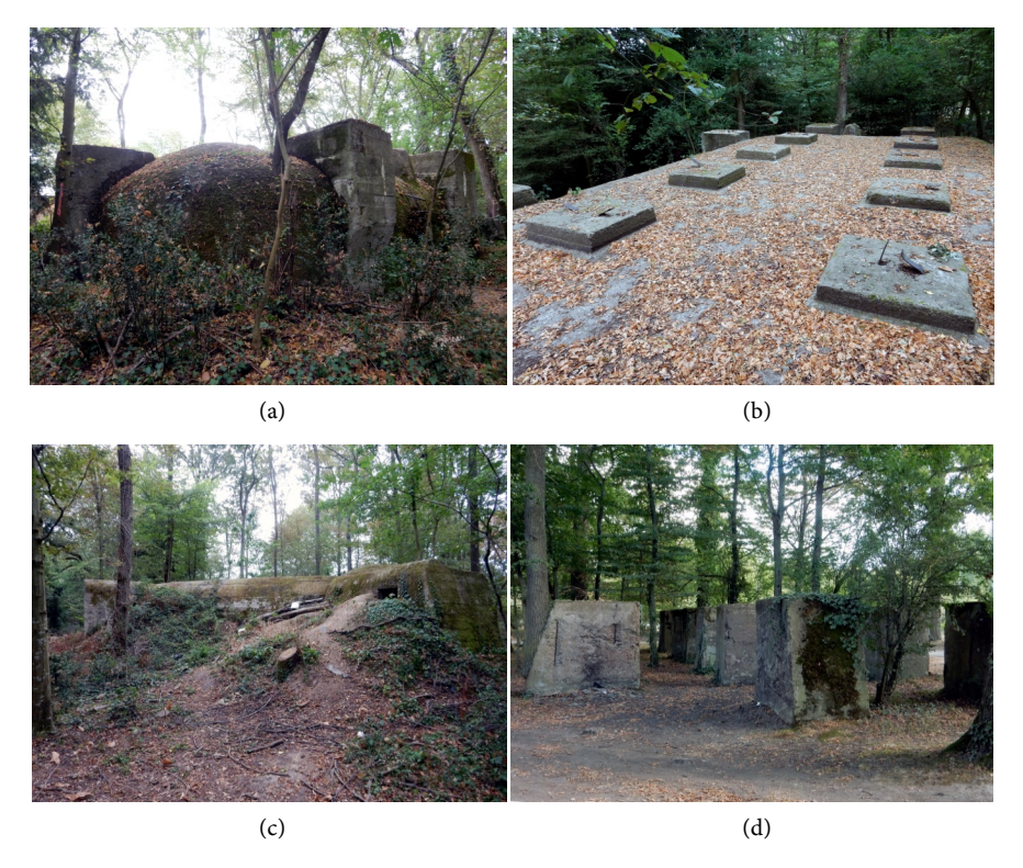
Figure 7. BDU site surviving components—(a) Sonderkonstruktion —side view; (b) Son-derkonstruktion —coverage with square supports bases; (c) R 611 or R 621—entrance side; (d) concrete aligned supports.

ciphering/deciphering and order transmissions through the antennas on the bunker coverage, which had top in shape of bicycle wheel; rooms (57) were used for statics about the sunken tonnage, calculations about the moonrise on all the seas and oceans, stored maritime maps, documents and files containing information about each U-Boot (Coiffard, 2006).