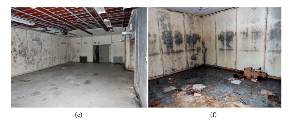
Figure 10. Admiral bunker (37)—(a) armored sliding door, on the right electrical, heating element; (b) internal room, suspended ceiling with white coverage panels in place; (c) modern galvanized aerator; (d) internal room, metallic suspension frame in place and white panels fallen on the floor; (e) internal room with metallic suspension frame and no white coverage panels; (f) internal room, white painted walls with marked traces of moisture.

place, sometime gray re-painted, sometime rusted but preserving their original blue painting.