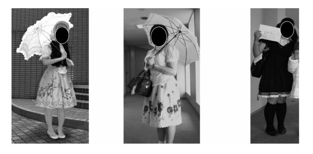
Figure 5. Lolita fashion among the respondents in 2006.

The respondents were asked to identify their personal styles and their favorite fashion magazines, and a comparison between their answers and their photographs were examined in order to understand the influence of the fashion magazines. In 2006, the respondents followed the fashion styles provided by the magazines and hardly modified the styles that they wore. Therefore, it was not so difficult to distinguish their fashion styles by their appearances. The imitation of the style was easily observed in Lolita fashion, where wearers strictly adhered to the dress code of the style of the original concepts as shown in Figure 5. Luo (2008) also found in her study that Japanese teens were easily affected by the fashion from the magazines and some even copied and dressed exactly like the model in the magazines. In 2010, many of the respondents dressed in contrast to the style suggested by their favorite magazines as could be seen in Figure 6, especially for the Kera's readers who did