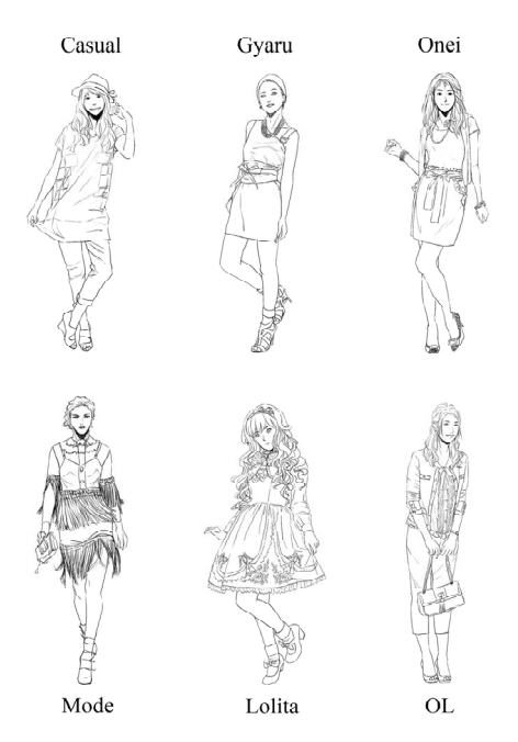
Figure 1. Illustrative representation prominent Japanese street styles.

A brief description of each style: Casual style is simple, non-distinctive, relaxed, and informal appearance. Gyaru cloth is florid, exposed and body-tight. Onei costume is extremely feminine and mature, and decorated with lace and ribbon. Mode cloth is designed in a similar concept of haute couture. Lolita outfit is influenced by Rococo, Victorian, and Edwardian styles, where headwear, bloomers, socks, shoes, and accessories such as umbrella and bag are basic elements. OL design is conservative, and resembles the fashion of working women.