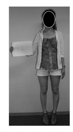
Top: spaghetti strap tank top influenced by Gyaru style. Bottom: short pants.