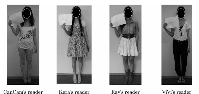
CanCam's reader Kera's reader v