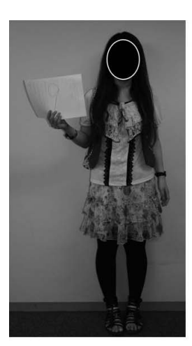
Top: feminine looking tshirt, decorated with ribbon and lace, influenced by Onei fashion. Bottom: floral printed skirt.