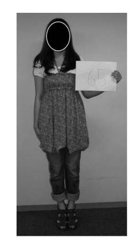
Top: floral printed halter dress influenced by Gyaru style and regular t-shirt. Bottom: regular jeans.