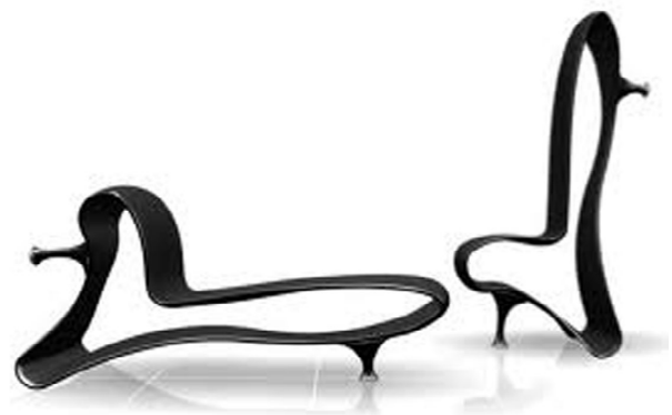
Figure 2-1: Chairs designed by calligraphy element

There are Chinese poets like “Chicken sound rural inn month, person mark plank bridge frost” , and there is other “Trail westerly thin horse, vine veteran dark Crow”, but it’s stacking a succession of nouns, no subjects, no verbs, this is rarely seen, maybe this is also stream of