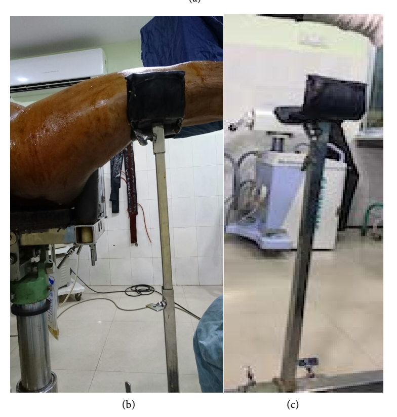
Figure 1. (a) showing the fracture table attachment to assist in reduction; (b) with the limb attached and elevated; (c) the attachment compatible with sliding.