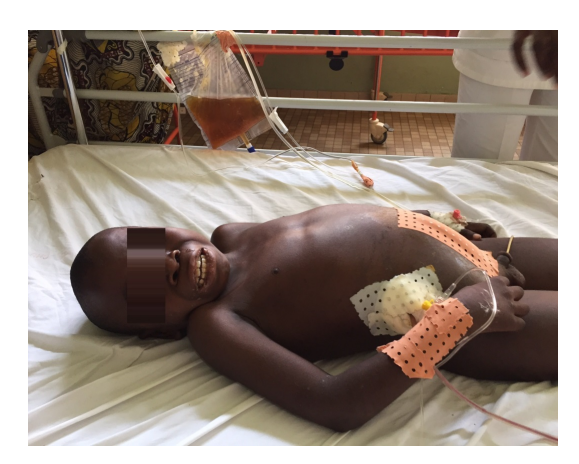
Figure 1. Clinical presentation on admission-trismus and generalized muscle rigidity.

Upon his admission to our service, he was conscious and well colored. He had a respiratory discomfort with a discreet flapping of the wings of his nose. Oxygen saturation amounted to 88% in ambient air. The temperature was at 38.5°C, heart rate at 102 beats per minute, respiratory rate at 24 cycles per minute. He weighed 18 kg for a height of 95 cm; hence a body mass index of 14.87 kg/m², the height-age and weight ratio was less than three Z-score (for a target size of 155 cm). His father and mother were 149 cm and 147 cm tall respectively.