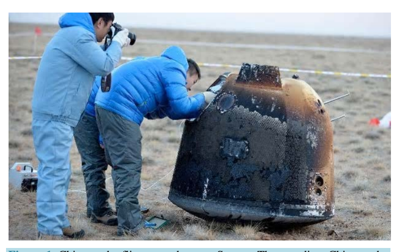
Figure 1. China probe flies around moon.