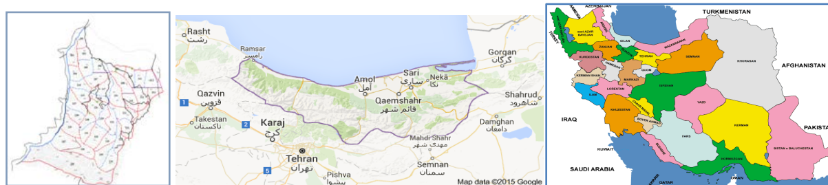
Figure 1. Location of the study area.

Univariate linear and non-linear regression models were developed using measured variables. Linear and non-linear regression analysis were parameterized to predict the values of LAI using a set of allometric parameters including DBH, height, crown area and their combinations of sampling trees of Oriental Beech, Hornbeam and Chestnut-leaved Oak ( Table 2 and Table 3 ).