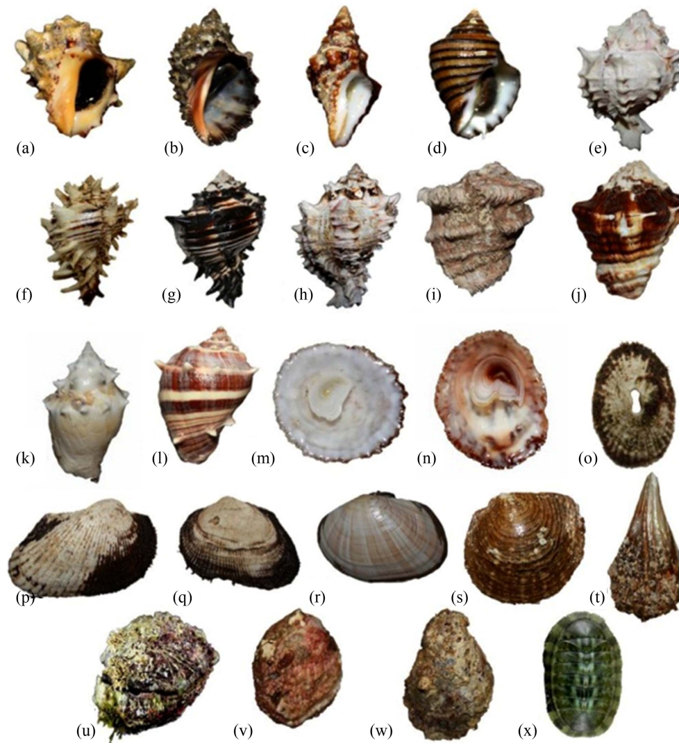
Pictures collection of marine invertebrates. Unid Académica de Ecología Marina. Universidad Autónoma de Guerrero

(a) Maninella speciosa ; (b) Plicopurpura pansa ; (c) Leucozonia cerata ; (d) Opeatostoma pseudodon ; (e) Chicoreus erythrostomus ; (f) Muricanthus princeps ; (g) Muricanthus radix ; (h) Chicoreus regius ; (i) Neoropanna muricata ; (j) Vasum caestus ; (k) Strombus gracilior ; (l) Melongena corona ; (m) Crucibulum scutellatum ; (n) Crucibulum umbrella ; (o) Fissurella gemmata ; (p) Anadara formosa ; (q) Barbatia reeveana ; (r) Gary maxima ; (s) Pinctada mazatlanica ; (t) Chama coralloides ; (u) Chama mexicana ; (v) Crassostrea primatica ; (w) Pinna rugosa ; (x) Chiton articulatus .