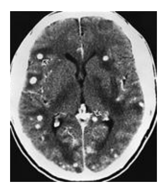
Figure 4. Multiple calcifications in the brain in cerebral Tuberculosis.