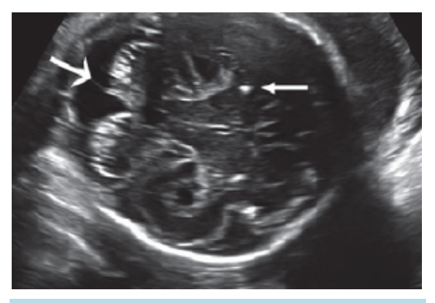
Figure 3. Trans-abdominal axial ultrasound image shows cerebral calcifications in a Zika patient.

But curiously, the calcification and lesions purported to be from the Zika find their precise counterparts in CNS tuberculosis ( Figure 4 ). Intracranial calcification are common with tubercular involvement, particularly in the white matter of the frontal lobes, the cerebellum and at the brains base—and develop in 20% to 48% of patients with cerebral tuberculous [47]. In a series of 25 consecutive children who recovered from Central Nervous System TB, seventeen developed radiologically demonstrable intracranial calcifications [48].