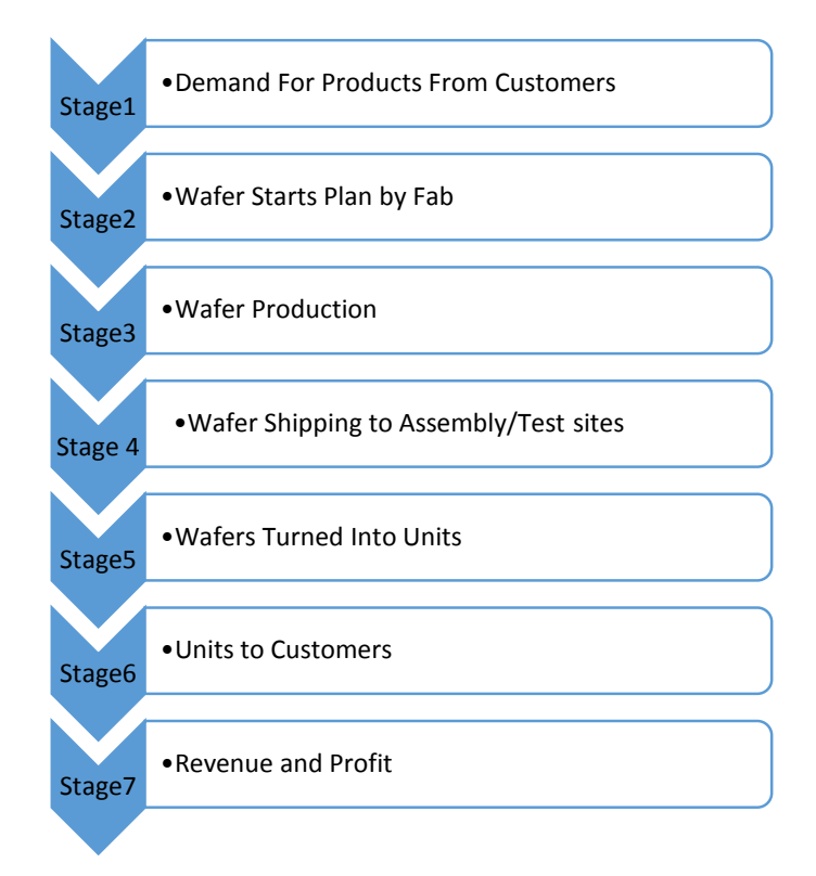
Figure 1. The SC network planning problem.