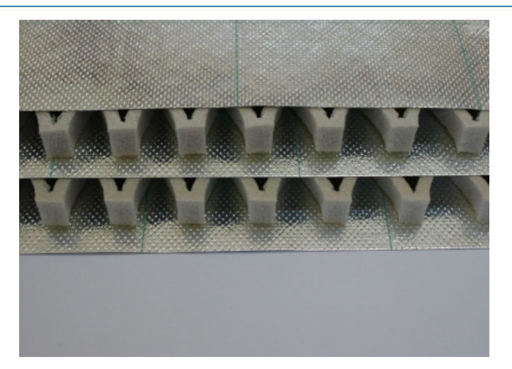
Figure 1. 20 mm-Thick low-emissivity hybrid insulation.

air cell and conductive polyethylene foam. Comprehensive thermal transmittance tests were conducted for the Low-Emissivity Hybrid Insulation of specimens of various thicknesses. The thicknesses of the specimens were 10, 20, 30, 40, 50, 60, 80, and 100 mm. Based on the test results, its insulation-affecting factors were in-vestigated using a trial-and-error method.