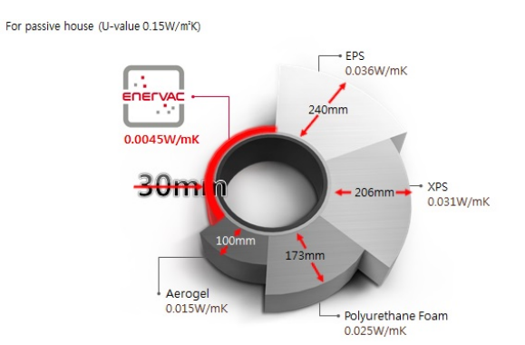
Figure 4. Required thickness of various insulations for passive houses.