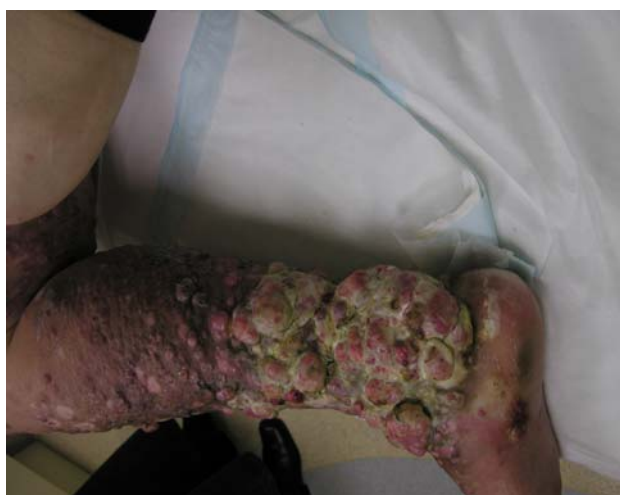
(a) August 2005