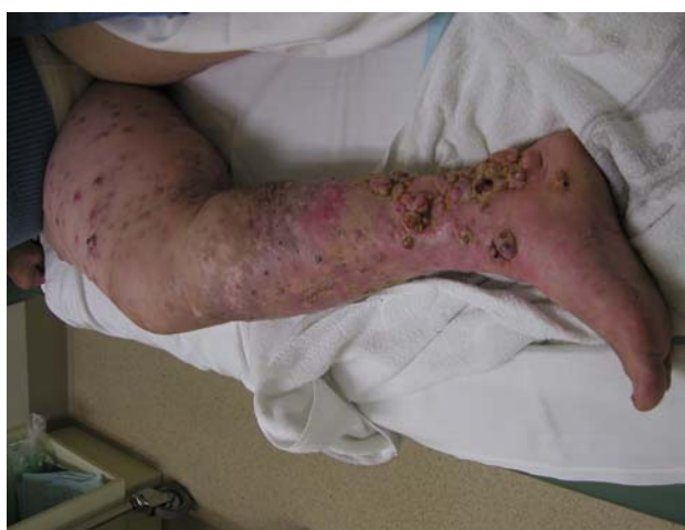
(b) December 2005

Figure 3. Patient treated with VMCL vaccine alone from August (before; a) to December 2005 (during; b). She was able to walk after the therapy and the pain, odour and self-care ability improved markedly.