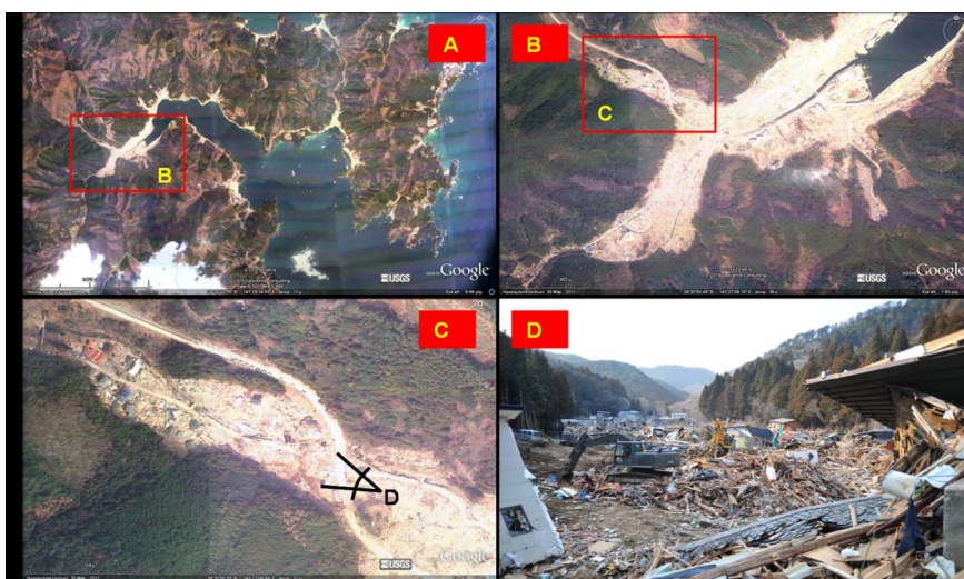
Figure 3. Three satellite images in subsequent zoom-in and a photo, from Ogatsu–Wan and Ogatsu town (Miyagi, zone C, 15m maximum run-up). Bathymetry and onshore geomorphology created funneling effects and wave reflection within the canyon and narrow valleys enhanced the tsunami effects. As a result, peak run-up reached the elevation of 38 m. Not only did the tsunami reach this elevation, but it arrived with several meters of height, performing a totally devastating run.