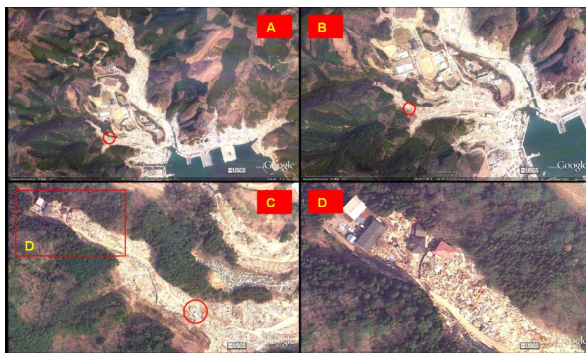
Figure 4. Four satellite images in subsequent zoom-in, from Onagawa Wan and Onagawa town (Miyagi, zone C, 15 maximum run-up). For the same reasons as for Ogatsu, Onagawa was hit by extremely disastrous tsunami run-up reaching 42 meters. In the red circles (photos A, B and C) a 30 m long vessel is shown, at a distance of 750 meters from the coast (elevation 21 m).