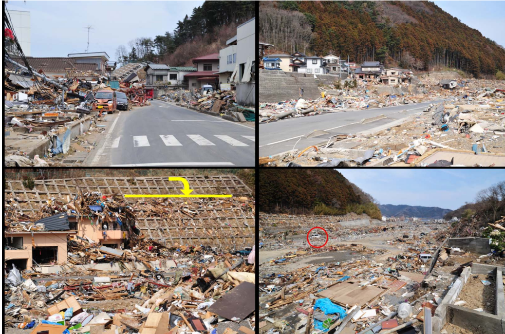
Figure 5. Onagawa town. At least 10m of wave height swept away the whole “corridor” within the narrow valley. The red circle indicates the position of a van.

Love waves in seismology [14]). Ishii and Abe suggest that phase and group velocities of edge waves depend on the shelf slope angle [15]. For irregular coastlines, edge waves will be scattered and reflected and, where these different phases (trapped and nontrapped) interfere constructively and at antipodes, large nearshore tsunami amplitudes can be realized.