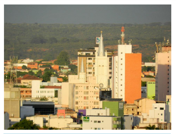
Photo 2. City district of Montes Claros (Jean-Claude Bolay, 2015).