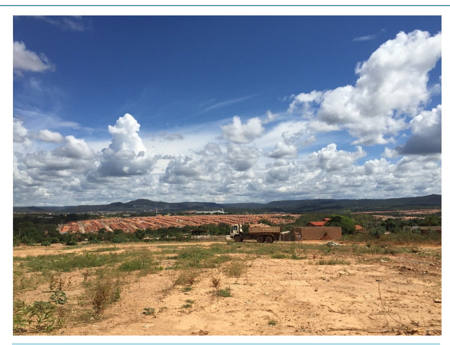
Photo 5. New social housing settlement in Montes Claros.