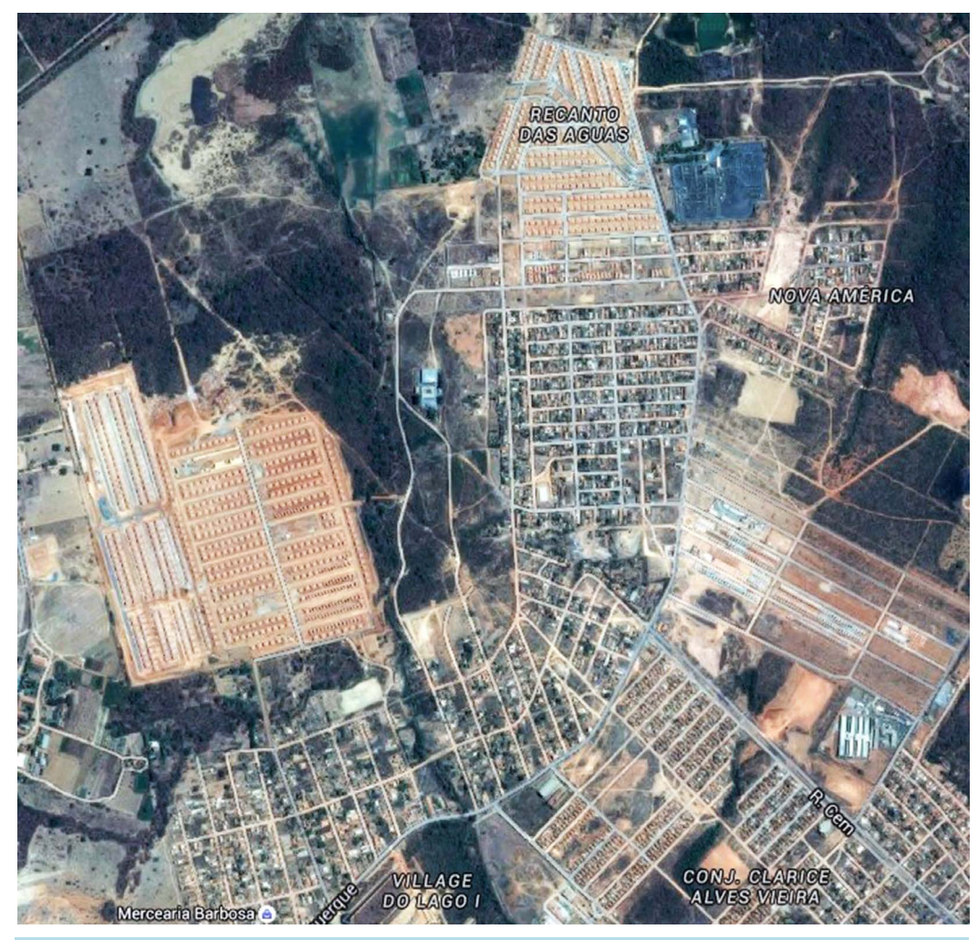
Photo 7. New suburb neighbourhoods in Montes Claros (Google map, 2015).

deterioration of its forest-covered hills and its rivers). What prevails are personal and political interests that couple political action and financial advantages to benefit the local elite.