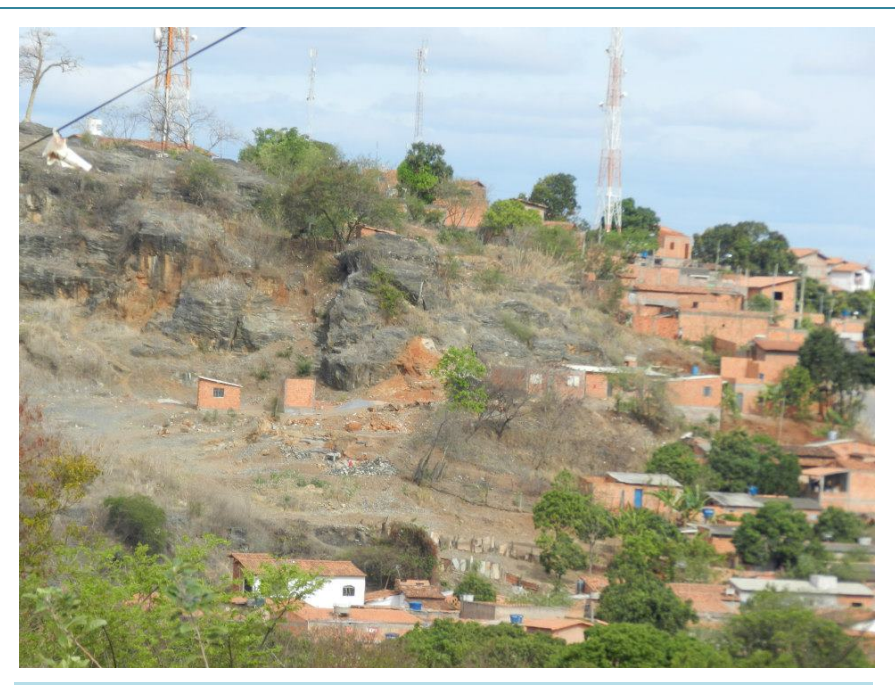
Photo 4. Recently built outskirts of Montes Claros.

Other technical questions relate mainly to: the electric power supply (inadequate in certain suburbs), harvesting, recycling and solid waste treatment<sup>17</sup> (while landfills exist, they do not comply with environmental protection standards and have a negative impact), land use (which is poorly regulated), seismic monitoring and protection measures (in the event of earthquakes), and transport systems.