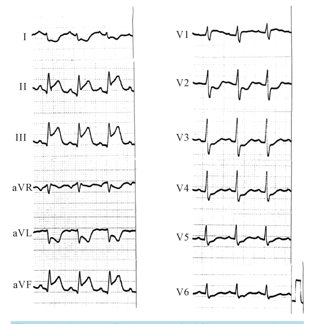
Figure 1. Electrocardiogram on arrival in emergency department showing ST segment elevation in leads II, III, aVF and reciprocal ST segment depression in I, aVL and V2-V6.

Immediately after the brain CT, which revealed no evidence of intracranial injury, the patient suddenly developed VF. Although recovery of spontaneous circulation was achieved via defibrillation and chest compressions, recurrent episodes of VF were observed, which required coronary angiography (CAG) at 3 h after the accident. We observed that the most proximal portion of her right coronary artery (RCA) appeared to be dilated