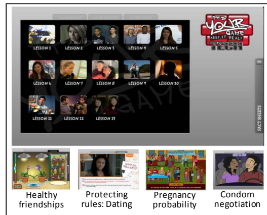
Figure 3. IYG-Tech final lesson content (tabled) and IYG-Tech screen captures illustrating lesson menu and selected new activities.