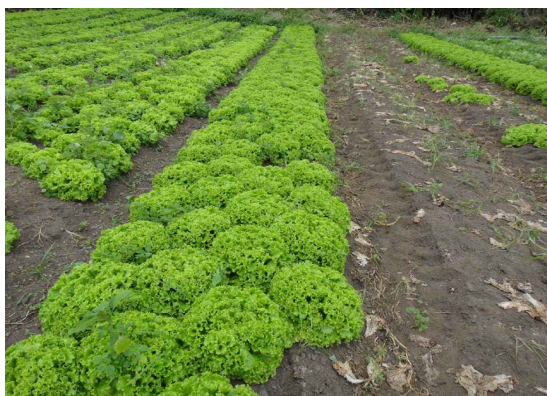
Figure 1. Lettuce in a field subject to the application of high C:N ratio organic material. Fifty-four days after planting (Nov 24, 2012) at Suzano, São Paulo, Brazil. Approximately 15 - 20 \text{ t} \cdot \text{ha}^{-1} \cdot \text{crop}^{-1} of fresh waste mushroom bed (C:N ratio, 39; moisture, 61.80%; total carbon, 19.10%; total nitrogen, 0.49%) was added to approximately 10 cm of surface soil using a rotary tiller. No other materials were used. There was no irrigation, even when a drought period exceeded 65 days. No disease or insect pests were observed. Productivity achieved was four times that of the national average.