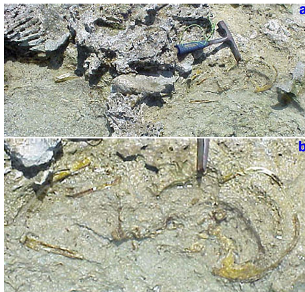
Figure 2. The remains of the “reef woman” and their stratigraphic position: the bones embedded in a beach sand, covered by coral rubble. Both the beds were later cemented into a beachrock.

Our interpretation (Mörner et al., 2004) is that sea level was at about the present level at the time of the death of the “reef woman”, that sea level rose shortly after to about +50 - 60 cm, depositing the coral rubble, then fell to about present level with cementation and beachrock formation (of the beach sand with