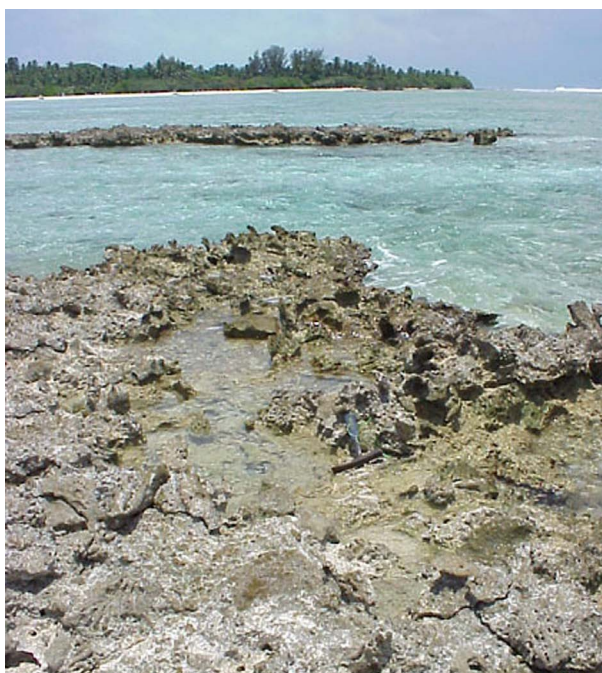
Figure 1. The “skeleton skerry” with the remains of the “ reef woman ” just to the left of the hammer (in the same position in Figure 2). Both skerries have a surface cut into a rock-cut platform corresponding to present high-tide level.