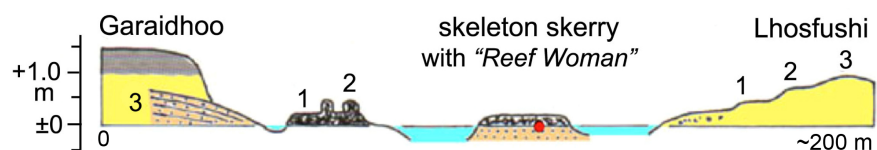
Figure 3. Stratigraphy and morphology at the Garaidhoo-Lhosfushi site with the “skeleton skerry” in the middle (redrawn from Mörner et al., 2004).