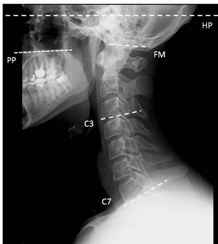
Figure 1. Lateral radiograph of the skull and cervical spine showing the lines drawn on each radiograph. HP, horizontal plane; FM, foramen magnum; PP, palatine bone plane; C3, third cervical vertebra; C7, seventh cervical vertebra.